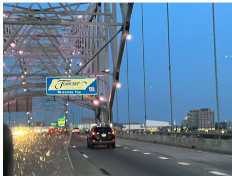
Crossing into Tennessee