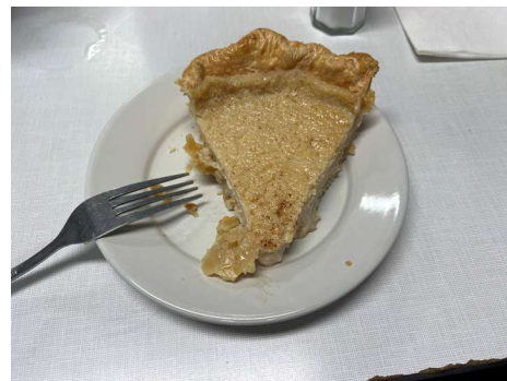
Sugar Cream Pie

It can take a few days to recover from a long hot ride. The right gear can help reduce that time and your body will thank you!