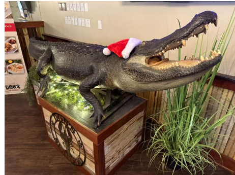
Merry Christmas Gator

The restaurant was empty at this time of the afternoon. Great! We had the place to ourselves!