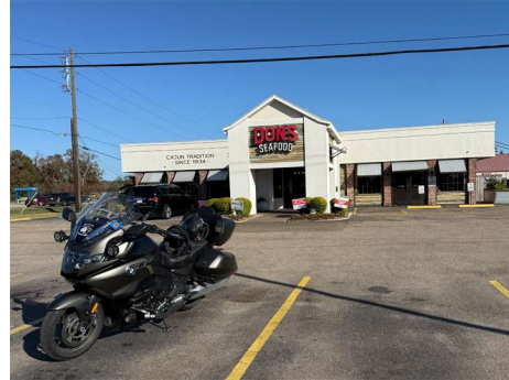
Don's Seafood in Hammond, LA

By now it was 2:30 pm, we had ridden 710 miles. We were ready for a break! Those BBQ sandwiches we had 5 hours ago had worn off!