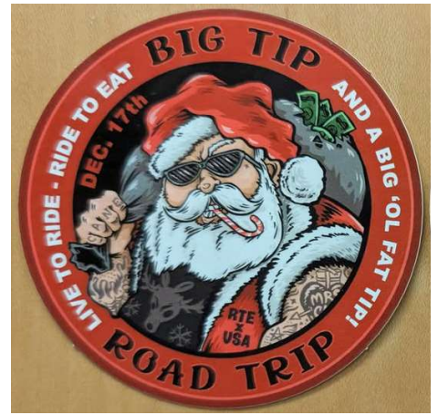
Sticker Provided by RTE-X-USA

Karen and I hopped out of bed at 3:30 am and out the door! We were headed to Louisiana for our second annual "Big Tip Road Trip"! It was 56 degrees as we left the local Circle K gas station. Official start time 4:03 am on December 17, 2024.