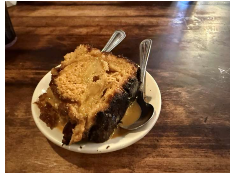
White Chocolate Bread Pudding