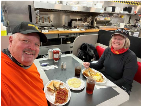
Hernando Waffle House