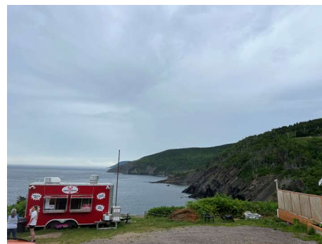
Meat Cove, Nova Scotia