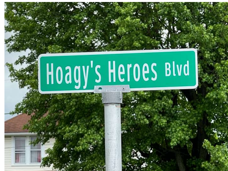
Glen Dale, West Virginia