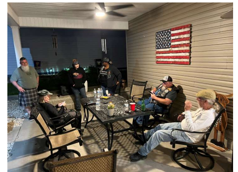
Hoagy's Garage Patio

of backroads. A tightknit group of great long-distance riders!