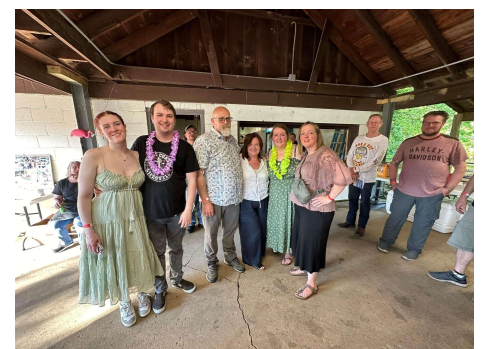
BAM's Family from Canada

Saturday's event had over 100 riders that showed up from all over the USA and Canada. BBQ Brisket and pork were prepared along with a shrimp boil! A lot of people volunteered their time and resources to make this a memorable occasion!