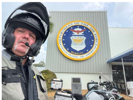
Eglin AFB, Florida

I stopped at the Air Force Armament Museum for my required photo. It was 1:00 pm.