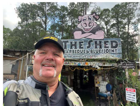
BBQ Heaven on HWY 57

reappeared! I enjoyed the brief shower to cool down. By the time I walked into The Shed, I was almost dry.